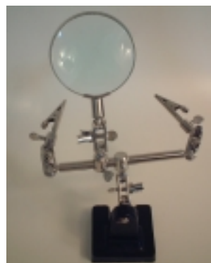
'HELPING HANDS'. Part No. 929D 65mm diameter glass magnifier with croc clip holders. Infinitely adjustable for holding small parts to be soldered etc.