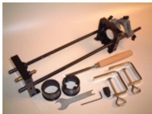
WOOD TURNING LATHE. Part No. 924D To be used in conjunction with COMO 'TURBO 5' 12v drill (pt. no. 595D) and COMO 'HEAVY DUTY MAINS TRANSFORMER' (pt. No. 400DHD). Invaluable for turning parts for dolls, chess figures, spherical components of models, button, lace bobbins, dolls house furniture etc. Comes complete with drill adaptors, spanners and one hand tool. Working length: 190mm Turning Dia. up to 25mm